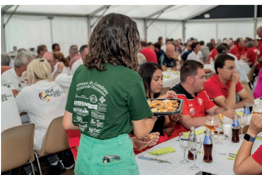
The members of the 'Jeunesse de Grandrieu' (Grandrieu youth club) came to lend a hand in serving the many guests.