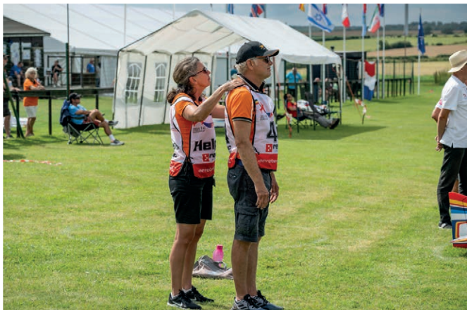
What could be better than a little massage to manage muscle tension cause by stress ?