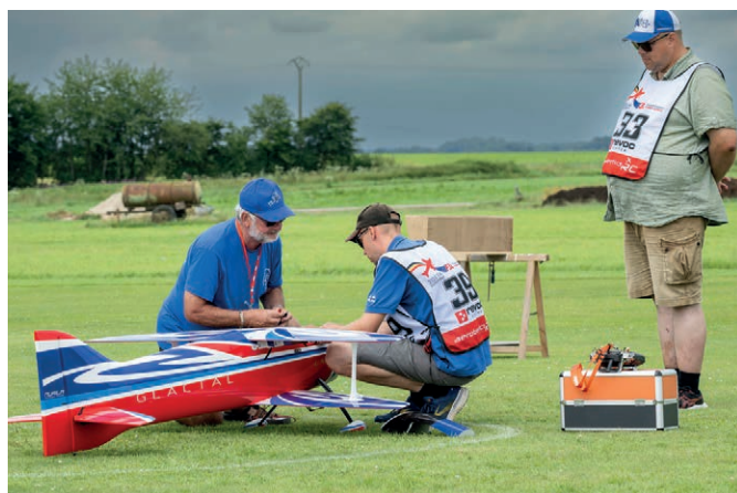
Reigning European Champion Lassi Narula in the starting box. The battery voltage is being checked.