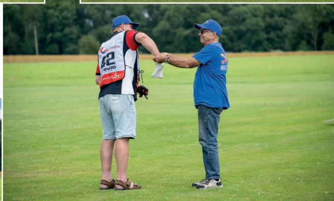
After your flight, you play the lotto. You draw a black ball and you win a new control of your plane.