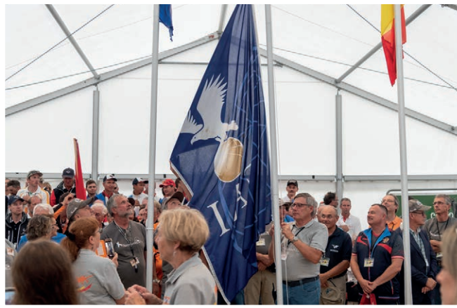
2018, the opening ceremony held in the marquee

The situation quickly improved and during the afternoon sunny spells broke through the cloud cover.